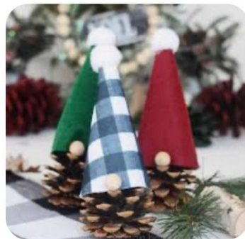
Ruffles and Rain Boots DIY Pinecone Gnomes...