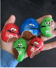
PAINTED ROCK M&M'S @gardenline