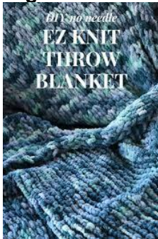
41. Lap Afghan, 36" x 60" woven.